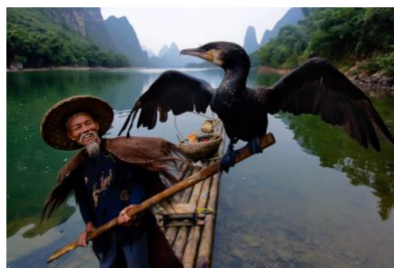
Fisherman with his cormorant. A very small number might still practice this type of fishing for self-sufficiency, but this particular scene is staged. There are photography guides in Guilin that will arrange these shots for photographers. Sometimes it will involve fake smoke/fog.