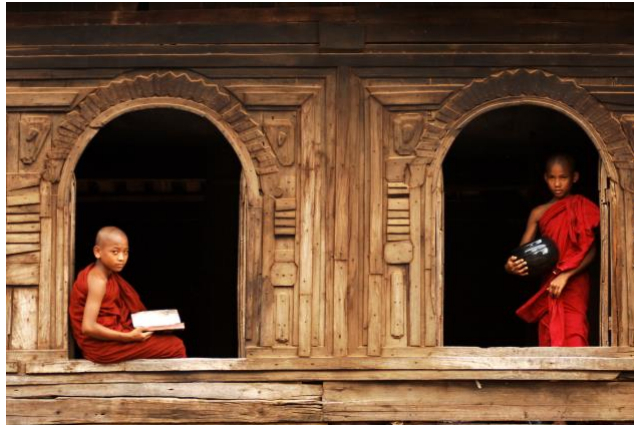
Photo Travel is a reality division, and images taken of set-up scenes or subjects that have been directed or hired are not allowed in Photo Travel sections. Set-up images can be entered into PID and PPD. In Photo Travel, entrants are obligated to show the world as it is found naturally.

Important information on the ethics of Photo Travel photography: https://www.picsofasia.com/the-library-of-fake-travel-photos-in-asia/ (the images in this article should be reviewed) https://www.picsofasia.com/stage-in-travel-photography/